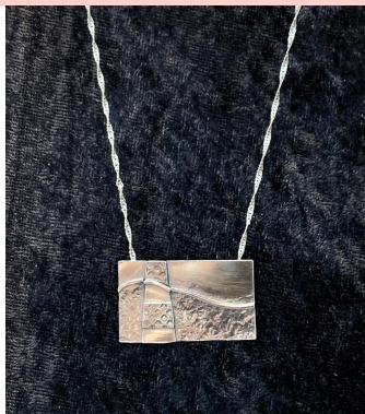
Mount Dora flag necklace in sterling silver by Helen Cutshaw