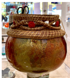
Pine needles in gourd vase by Janice McElroy