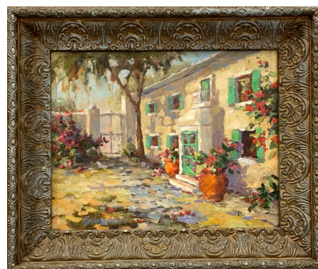
At Home, Acrylic painting. Original.