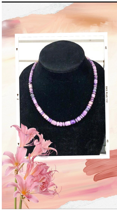
Fossil Coral flower necklace.