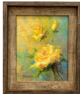
Yellow Roses 2