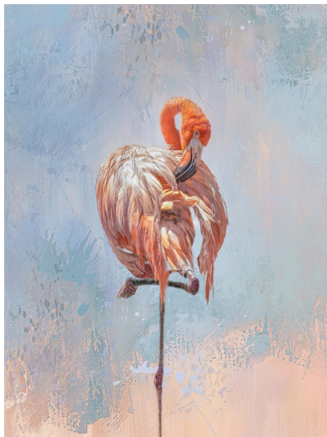
"Flamingo in one leg" add a touch of color to your space, elegant in a