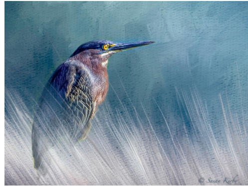
Little green Egret