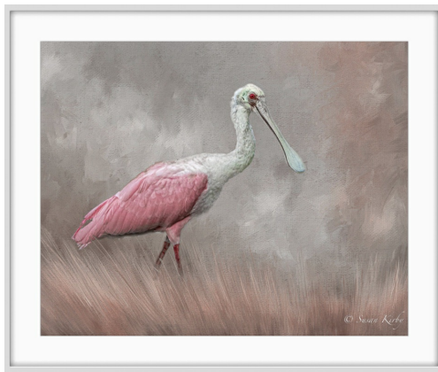
Rosette Spoonbill photography art