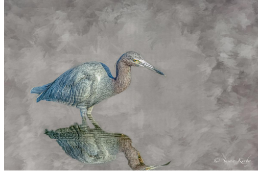
Little Blue photography.