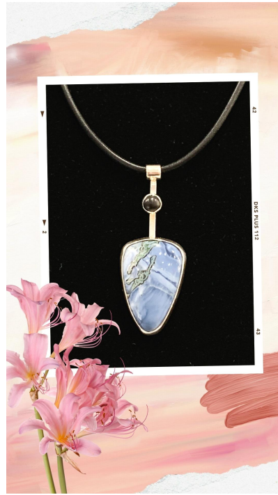
Sonora Dendrite necklace in sterling silver.