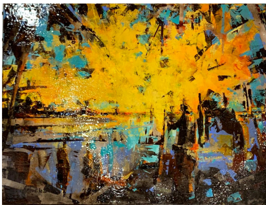
Agape #15 Acrylic, resin, glass.