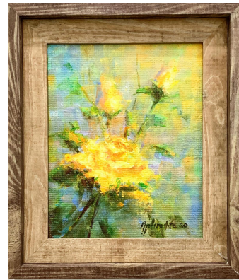
Yellow Roses 1, acrylic painting.