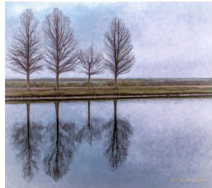
Winter Cypress photography art.