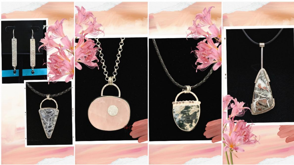
From left to right, Sterling silver earrings with black onyx beads and Black palm eye pendant. Rose Quartz with druzy, Moss Agate pendant and last one, San Simbon in sterling silver.