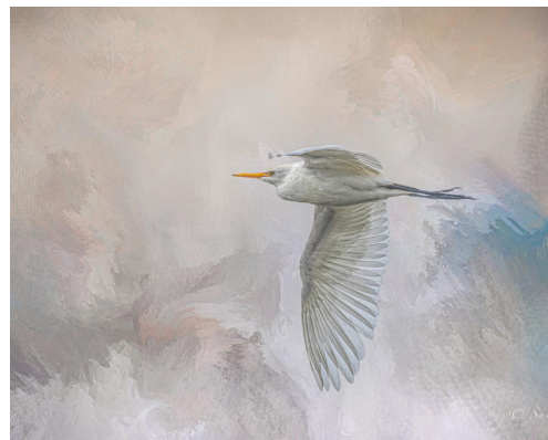
Flying Egret photography art. Prints any size per request.