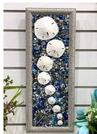
Sand Dollar wall art by Nancy Trumbull