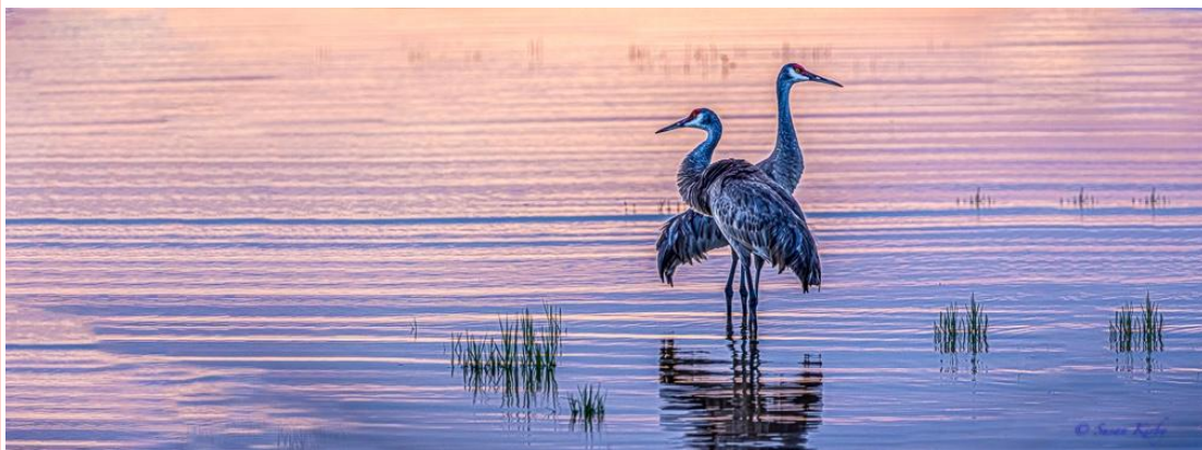
Sandhill Crane couple enjoying the sunset in the lake. Photography art.

All images are on display at Artisans on fifth window, matted prints are available too in 10x8" or 11x14". Custom sizes available, email us below, specify size, framed or matted.