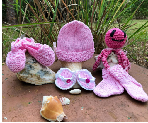
"Pink" Octopus toy for newborns, hat, shoes, flip-flops and booties.

Dolphin fiber wall art, Blue set of hat, shoes, flip-flops and booties.