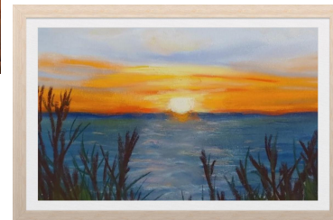
Ocean view pastel art by Sabrina Gowen

Shop Art, home decor and gifts from the comfort of your home, we will ship to you. We are open 24/7 in our online shop.