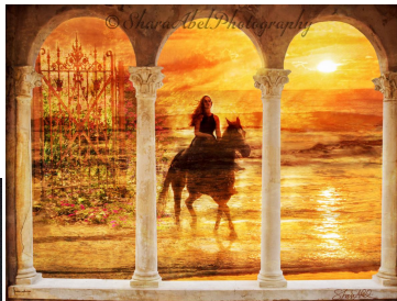
Girl riding on the beach, composite photograph by Shara Abel. Custom sizes available.