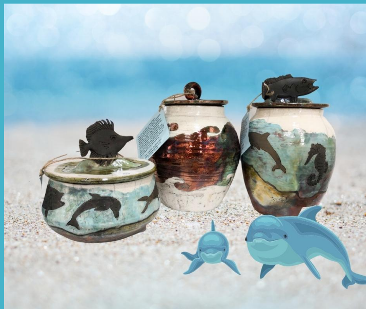
Lovely Sea horses and Dolphins Blue and Copper Raku vases. A beautiful way to remind people to conserve the habitat for these beautiful beings.