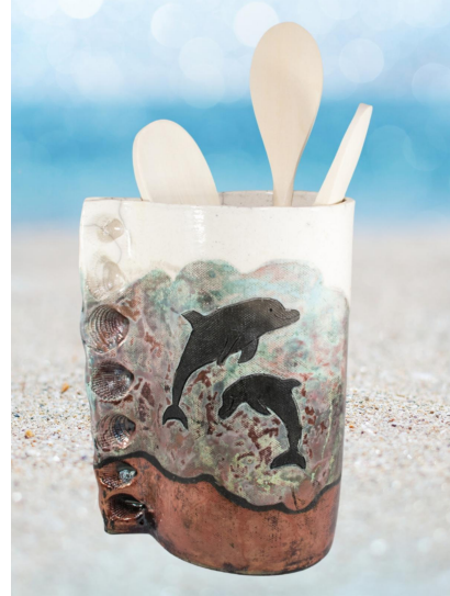
Dolphins Raku clay vase, use it in the kitchen or to keep your pencils or brushes organized. Available in various sizes.