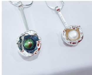
Fresh Water Pearls pendants by Debra Ham