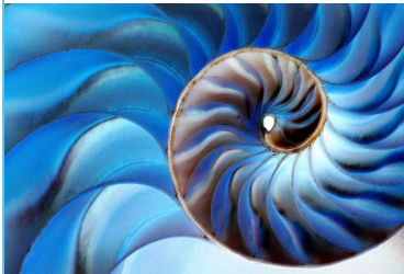
"Nautilus"photography by Laura Howell Custom sizes available.