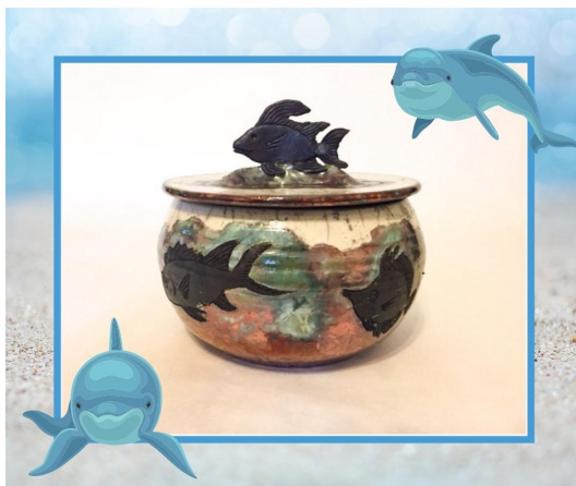
Ocean life raku clay vase with lid, ideal gift