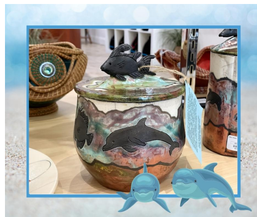
Fish and Dolphins Raku vase. Medium size.