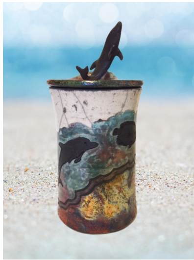
Dolphin vase with lid. A statement piece for your home.