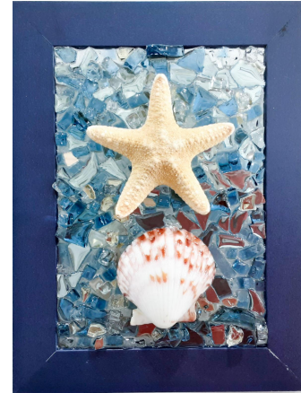
Sea star and shell with glass in resin art by Nancy Trumbull