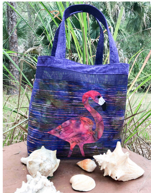
Flamingo Eco-friendly totes. Inspired by the pretty Pink Flamingos, Heather's line of reusable, washable, practical totes for every day use.