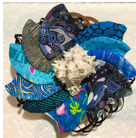
"Ocean Vibe" inspired double layer cotton fabric masks for everyone.