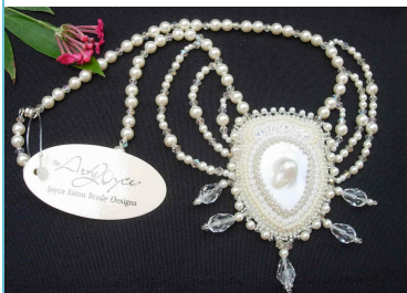
Blister pearl, bead embroidery necklace by Joyce Brady