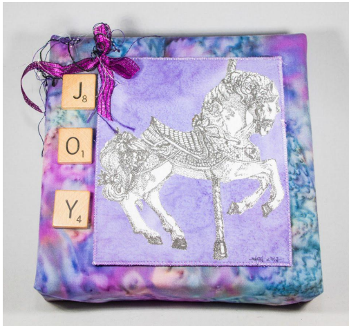
"Joy" fiber wall art.

"Joy" fiber art tote bag, flip-flops, Octopus toys in lovely purple colors.