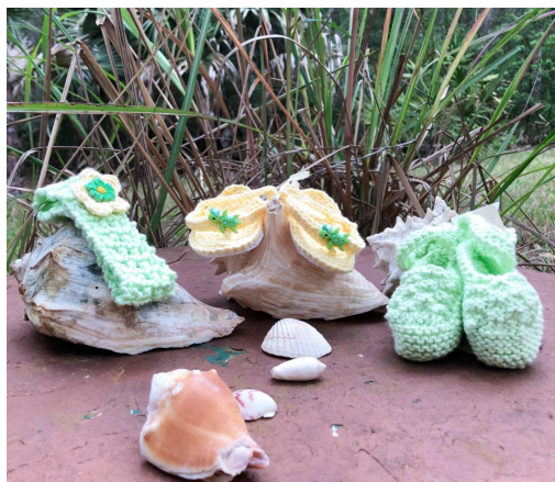
Little green and yellow crochet flip flop, shoes and head-band.