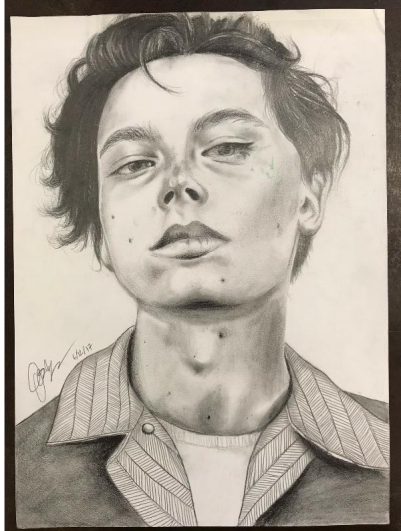
Drawing by A. Islava from Umatilla H.S.