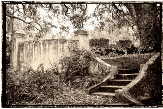
"Stairway" - FIRST PLACE