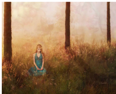
"Serenity" - FIRST PLACE