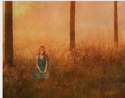
"Serenity in the Woods"