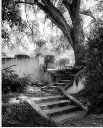
"Stairway to Heaven"