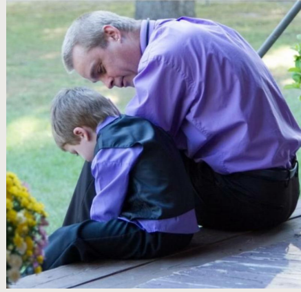
"Heart to Heart"