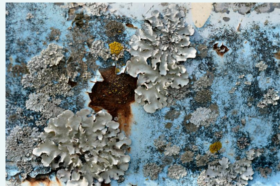
"Lichen & Rust"