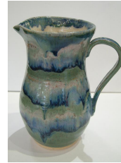
by Dawn Baldacchino